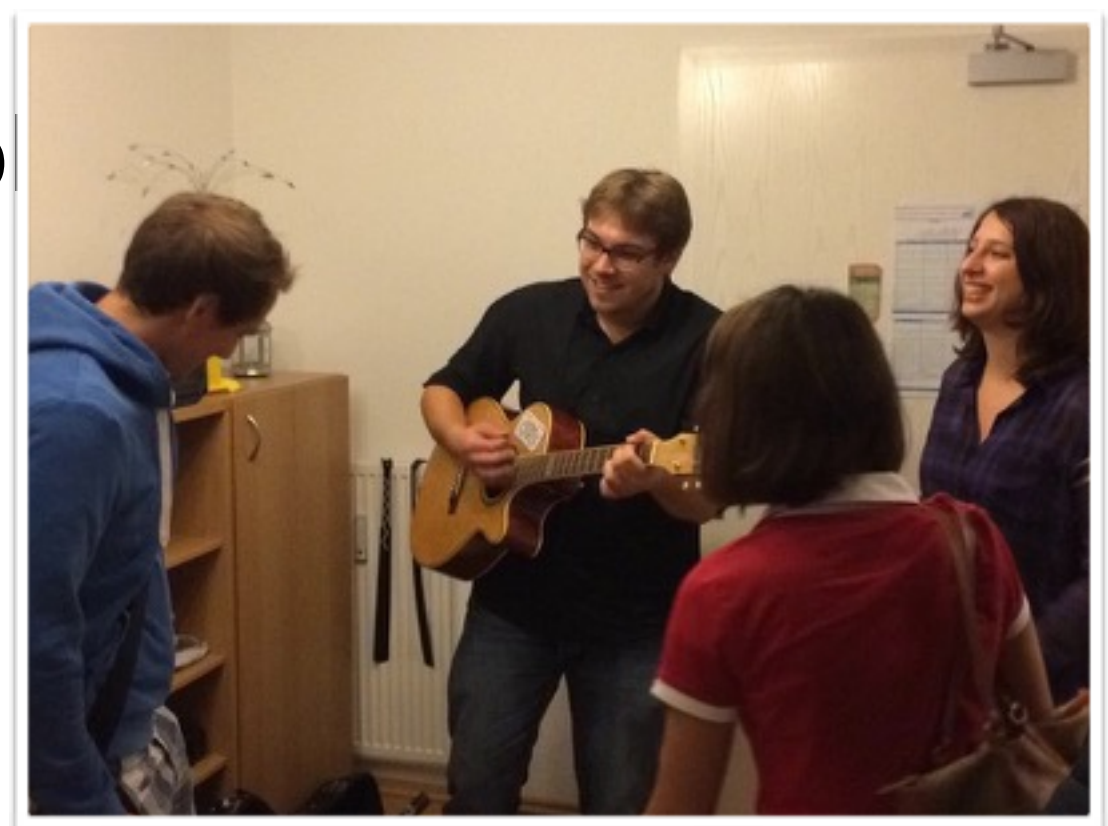
We are looking forward to your applications :-)